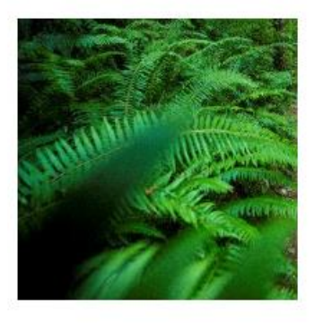
Amer Sports has established an ongoing corporate-wide process to evaluate its annual carbon emissions