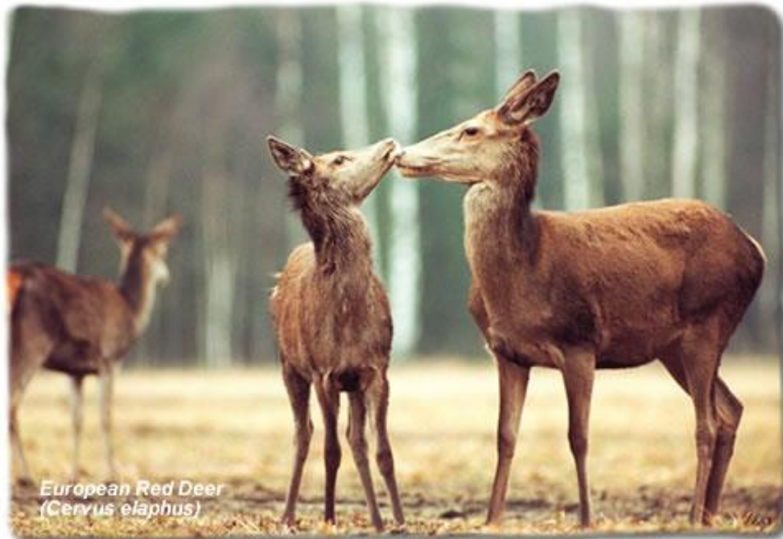
European Red Deer (Cervus elaphus)

Natural ecosystems, largely untouched by man, thrive in 50 per cent of the territory