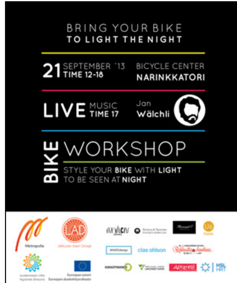
BANNER X 2: 1,8m X 2,2m